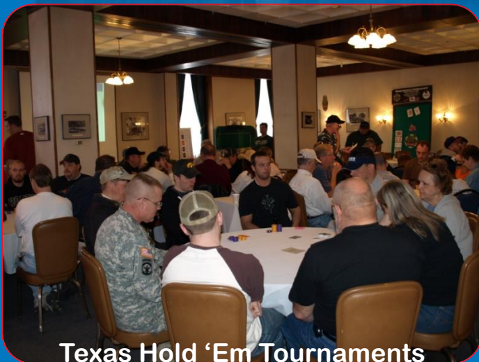
Texas Hold 'Em Tournaments

Month of the Military Child Army Birthday Celebration