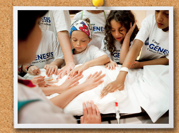
June 21 - 26, 2020